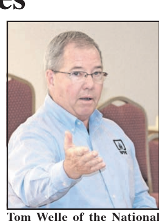
Fire Protection Association. To date, the Towns