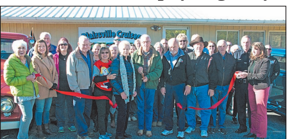
The Blairsville Cruisers with the Blairsville-Union County Chamber of Commerce for the Oct. 30 ribbon cutting at the Cruisers' new clubhouse on Murphy Highway.