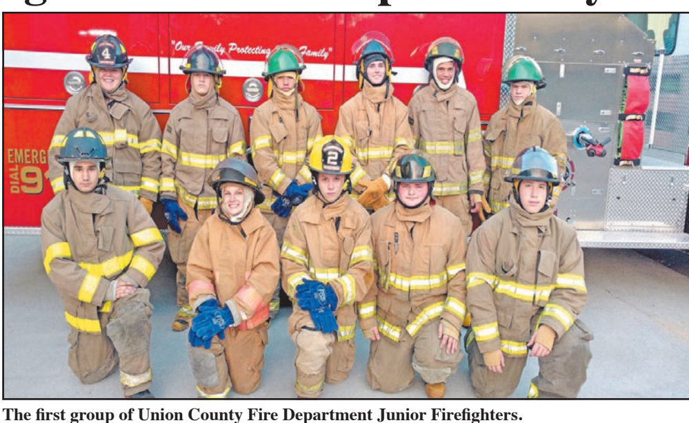
department is always recruiting for more volunteers both now and in the future.